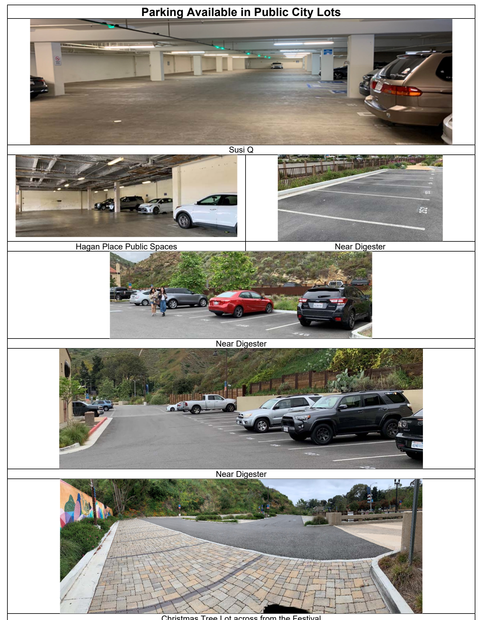
Christmas Tree Lot across from the Festival