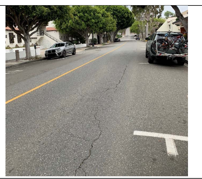
Third Street near Forest